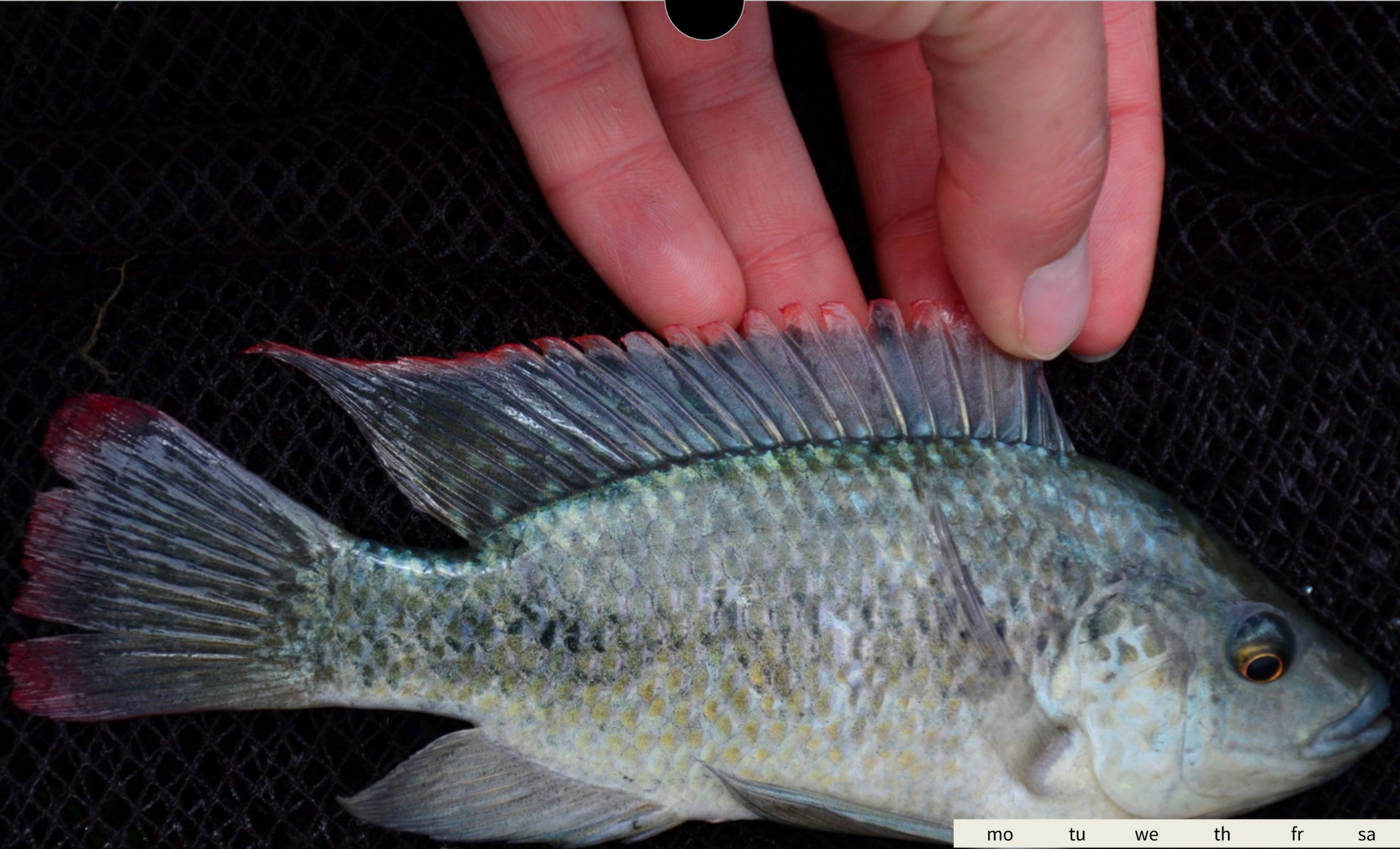
Another common "Chambo", Tilapia Rendalli. One of the most common Tilapia species in Malawian ponds