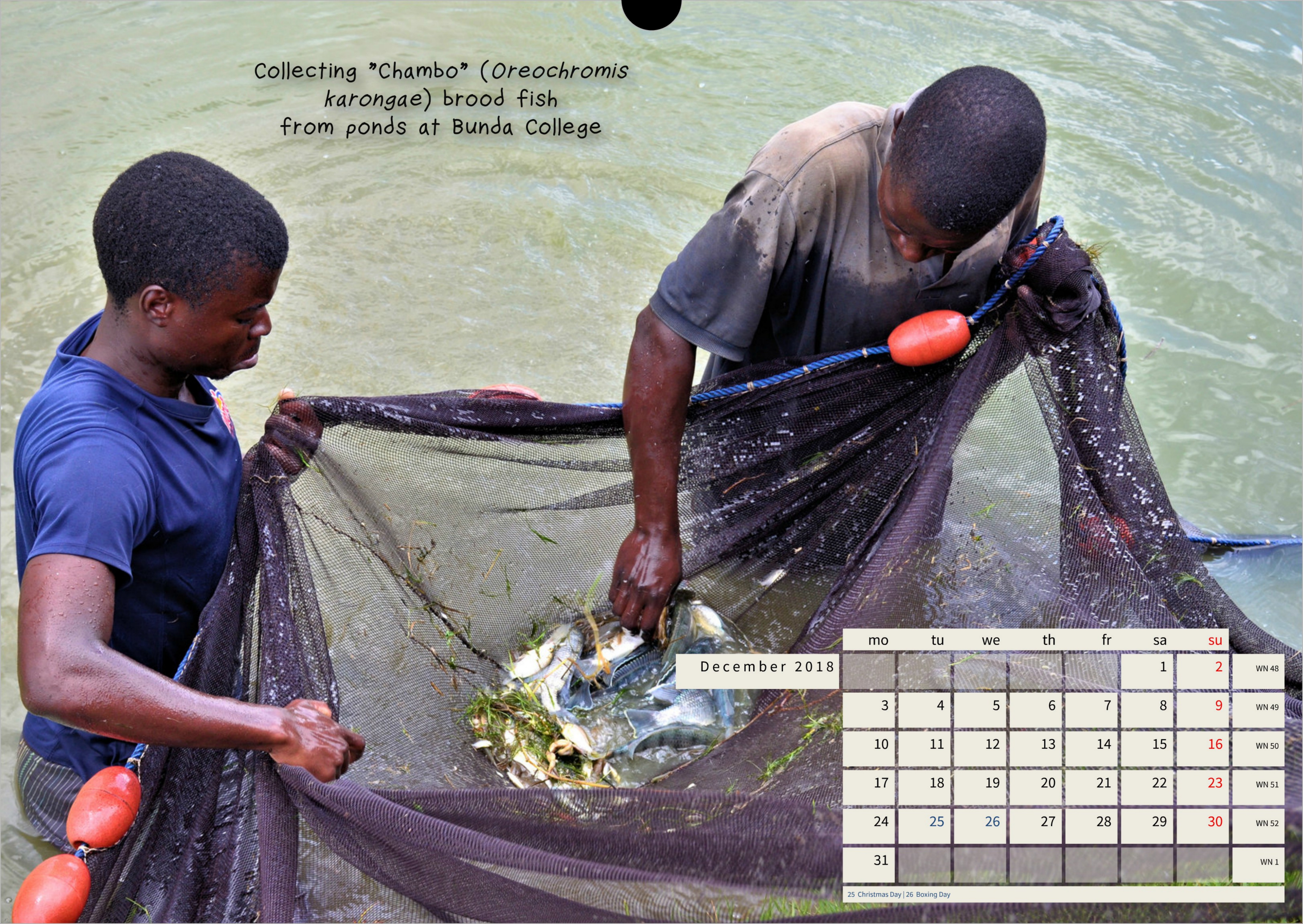
Collecting "Chambo" ( Oreochromis karongae ) brood fish from ponds at Bunda College