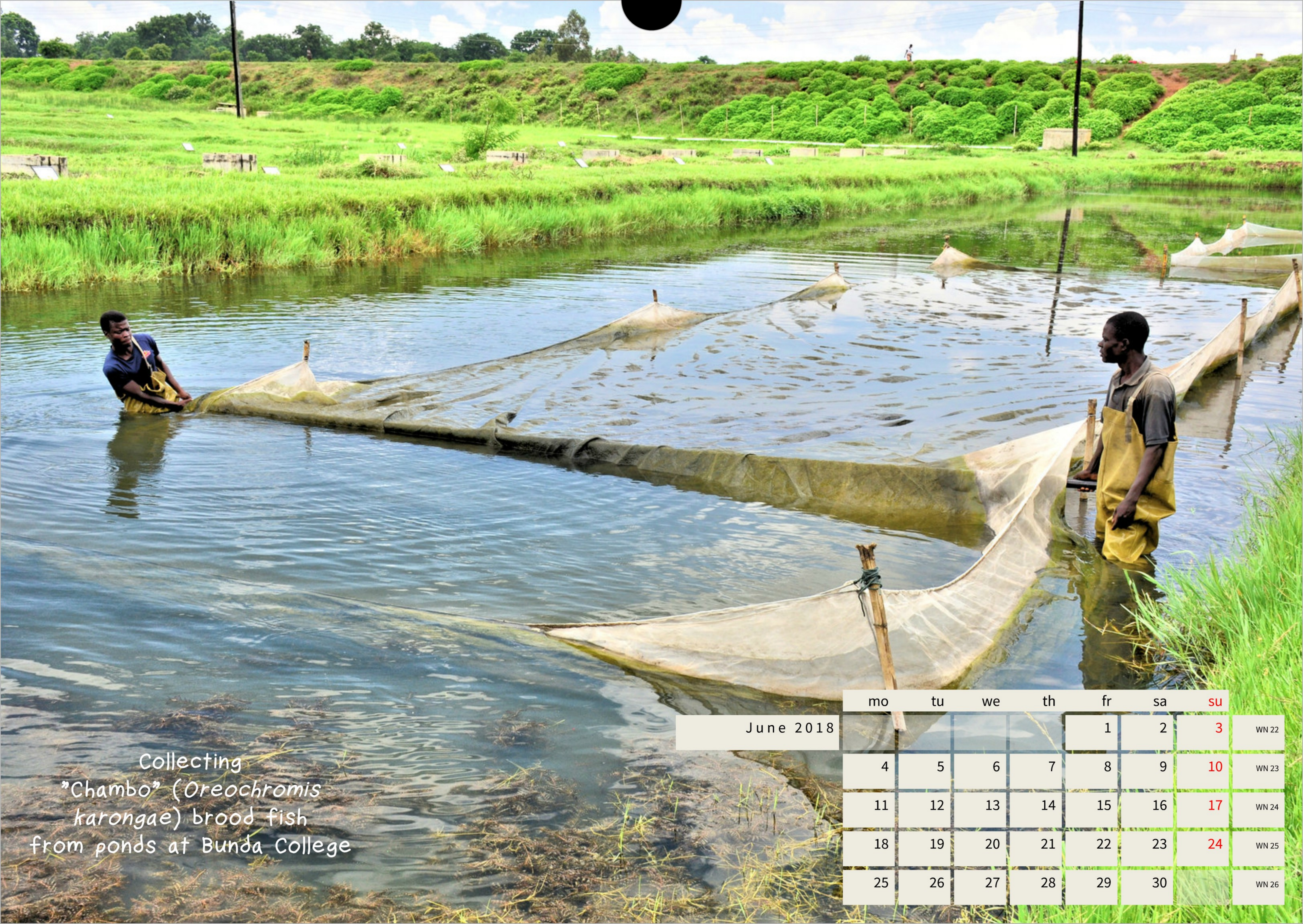
Collecting "Chambo" ( Oreochromis karongae ) brood fish from ponds at Bunda College